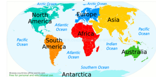
7 continents map with 5 oceans

A grid reference allows someone to mark a place on a map by referring to vertical and horizontal lines called 'eastings' and 'northings'. By using a four-figure reference point, it is possible to pinpoint a certain area of interest on the map to a varying degree of accuracy.